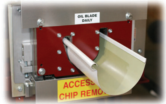
Front pull guillotine